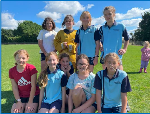
The junior girls were full of excitement after their race.

Thank you to our wonderful P&C for their flexibility and organisation of the hot dog day, it certainly was a wonderful lunchtime treat. Thank you and congratulations to all students for their excellent displays of sportsmanship and encouragement. It was a very enjoyable end to the term!