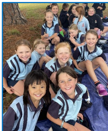
The junior girls are nervous, but very happy before their race.