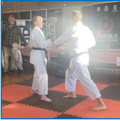
A karate demonstration by our external provider, Crookwell Karate Dojo, enthused many guests.