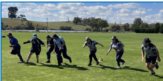
The hotly contested infants staff race was enjoyed by the spectators.