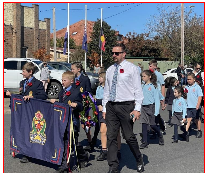
Our Prefects proudly lead the school down to the memorial ceremony on Anzac Day.