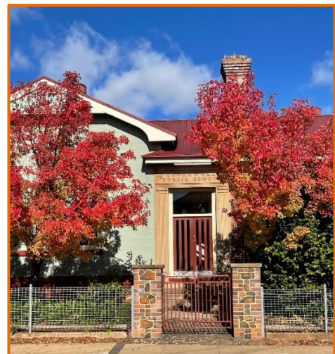
We are so fortunate to have such beautiful school grounds, particularly this time of year.