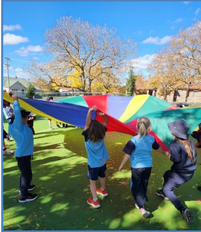
1/2 Kangaroo participate in an obstacle course challenge during the Open Day.