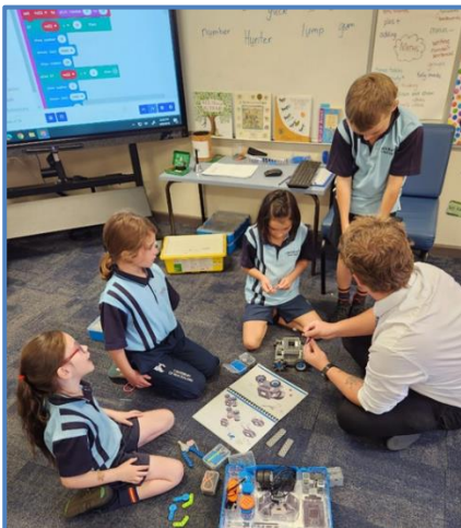
Mr Smoother challenges 1/2 Emu with some STEM kits.