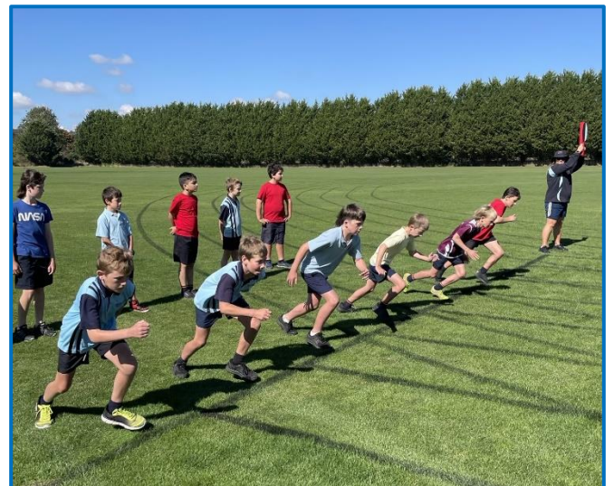
The boys take off for the 100m sprint.