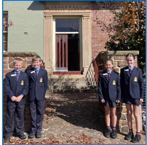
Our Prefects did a wonderful job welcoming visitors to our school and undertaking student-led tours.