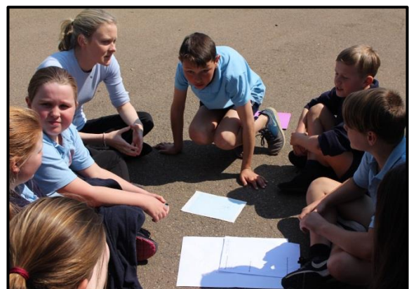
Camilla shared her ideas, concerns and possible solutions for projects with our students.