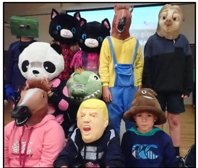
Year 5 model some of the various 'big head' characters that have become a recent trend.