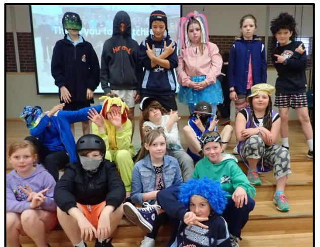
Year 5 showed off many terrific trends and fads from years gone past.