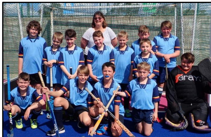
Finished in the top 8 for the state again!