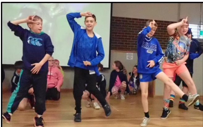
Year 5 students 'Take the L'.