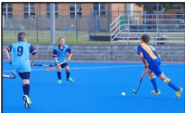
Crookwell's defence was very solid throughout the game.