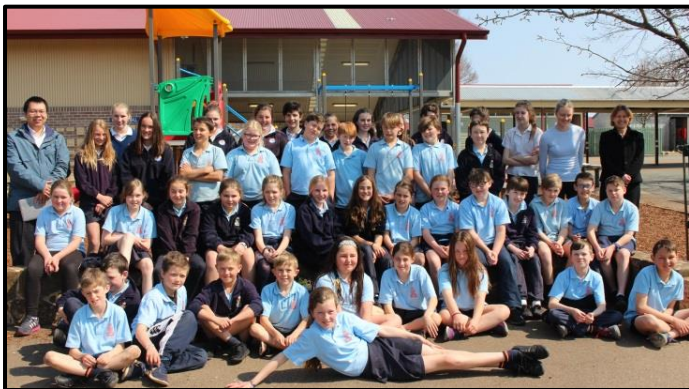
CHS Year 8 students, special guests and all Year 5 participants pose for a photo.