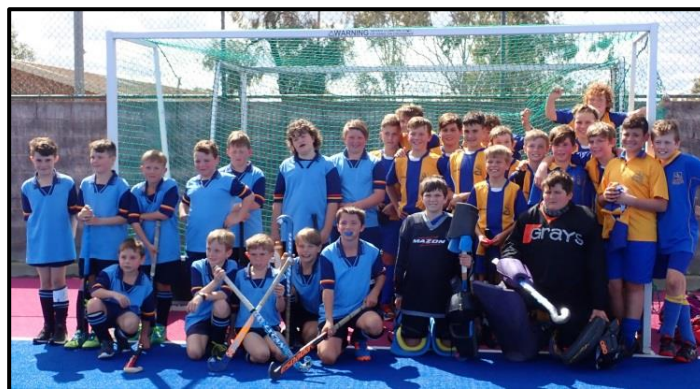
The teams celebrated together at the end of a very tiring game.