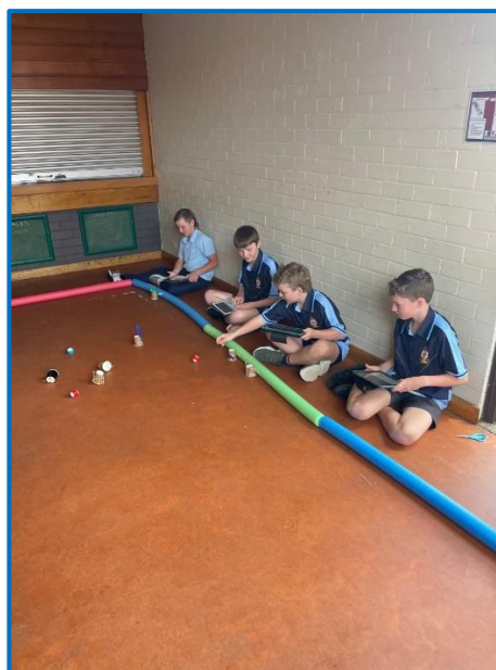
The battle for the best adapted Bot is on!