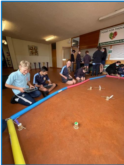
Students were all smiles as they utilised the Mini Spheros in the Battle Dome.