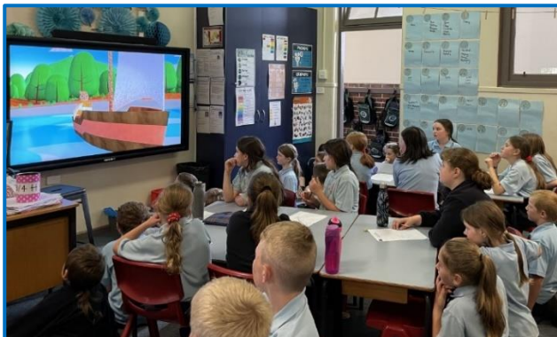
Students enjoyed watching the water safe videos.