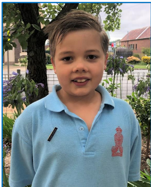
Year 1/2 Platypus ~ Isayah & Isabelle (absent)