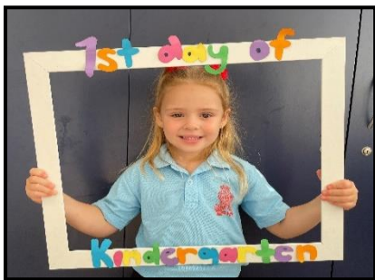
For The Calendar...