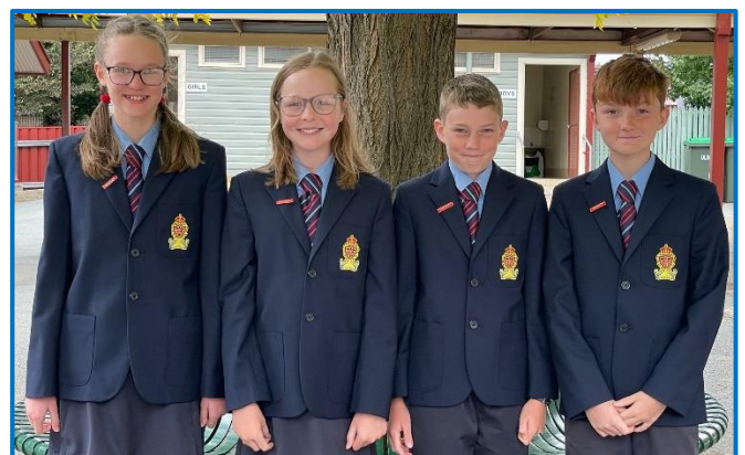
Our prefects of 2021!