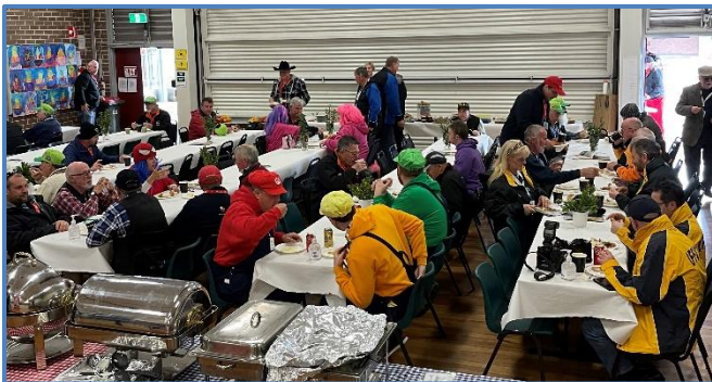
The hungry 'bashers' start to fill the hall and their bellies!