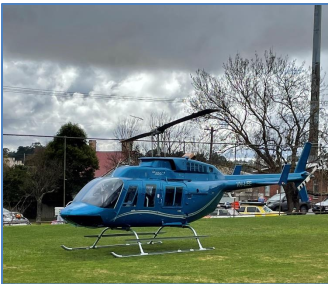
Why drive when you can fly?