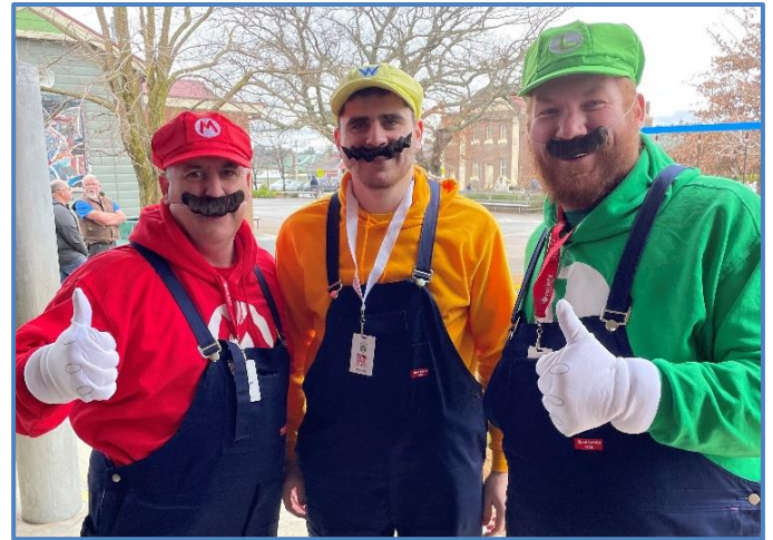
Mario, Wario and Luigi were some of the first characters to arrive.