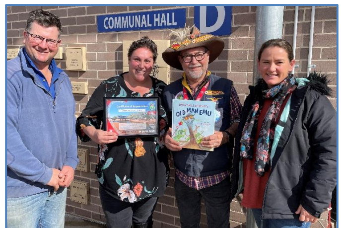
Country music legend, John Williamson, donated a signed copy of his book, Old Man Emu.