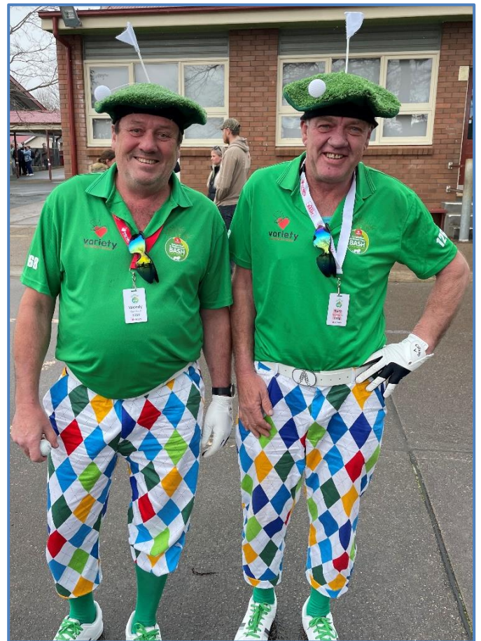
Golf anyone? A lot of effort went into these costumes.