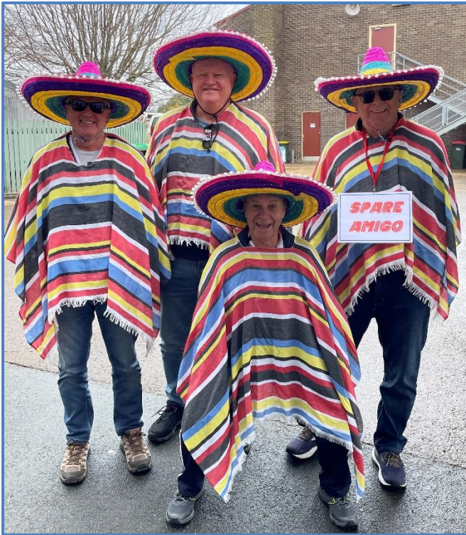
The 'bashers' were told to bring spares for their vehicles, so these guys also brought along a spare amigo!